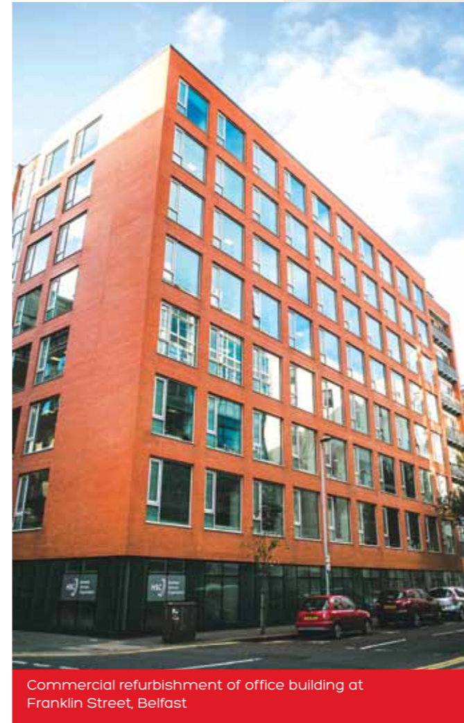
Commercial refurbishment of office building at Franklin Street, Belfast

Projects undertaken have ranged from minor refurbishment projects to entire building contracts in excess of £5m.