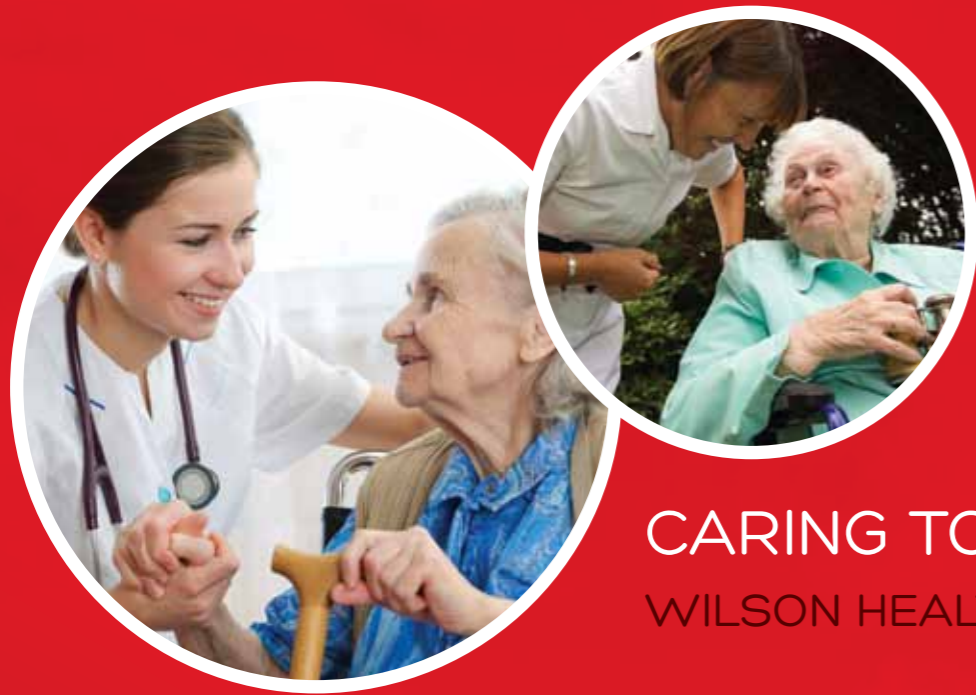
CARING TOGETHER WILSON HEALTHCARE