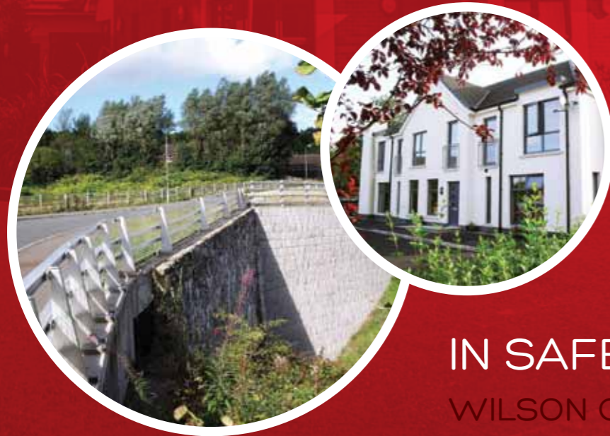
IN SAFE HANDS WILSON CONSTRUCTION