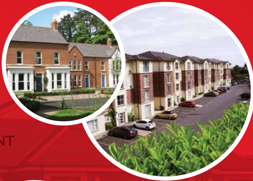
RESPONSIBLE PROPERTY DEVELOPMENT WILSON DEVELOPMENT