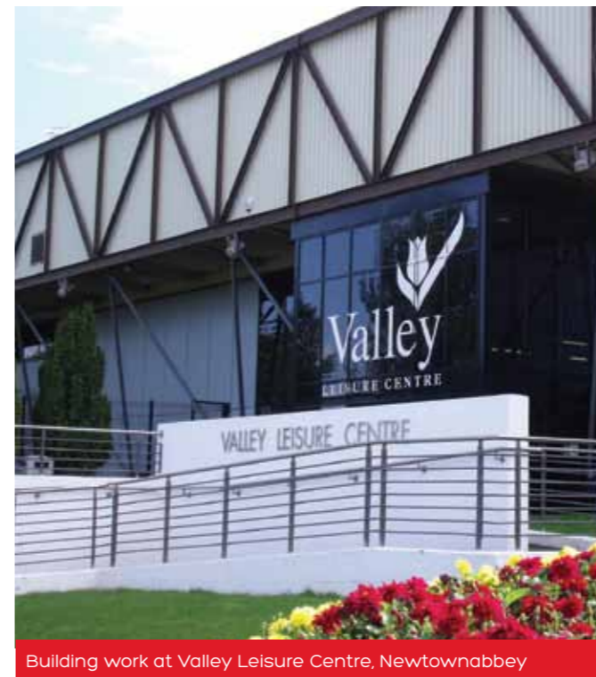
Building work at Valley Leisure Centre, Newtownabbey

We are a progressive company with a strong focus on customer care.