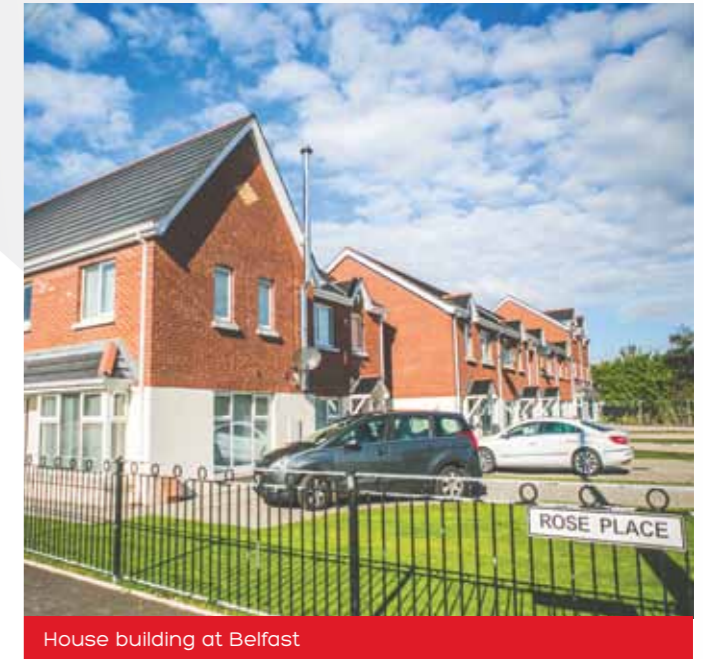
House building at Belfast

We are a progressive company with a strong focus on customer care.